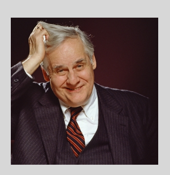
It's hard to know exactly how much income you'll need after you suffer a disability, but you'll probably need more than you think.

Workers' compensation and Social Security are two well-known government disability insurance programs. In addition, five states (California, Hawaii, New Jersey, New York, and Rhode Island) have mandatory disability insurance programs that provide disability benefits to residents. If you are a civil service worker, a military servicemember, or other